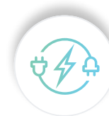
Electrical Service & Maintenance

1850 Dividend Drive | Columbus, OH 43228 | 614.867.5747 | evolvedle.com